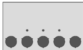
IC983007 20 in. Drop with (3) ¾ in. Light Holes & (5) 4 in. Light Holes