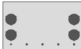
IC983008 20 in. Drop with (5) ¾ in. Lights & (4) 4 in. Light Holes