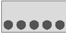
IC983009 16 in. Drop with (5) 4 in. Lights