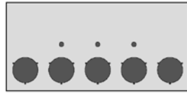
IC983010 16 in. Drop with (3) ¾ in. Light Holes & (5) 4 in. Light Holes