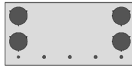
IC983011 16 in. Drop with (5) ¾ in. Lights & (4) 4 in. Light Holes