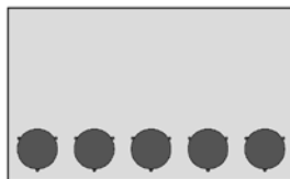
IC983006 20 in. Drop with (5) 4 in. Lights