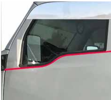
*Red Denotes Product