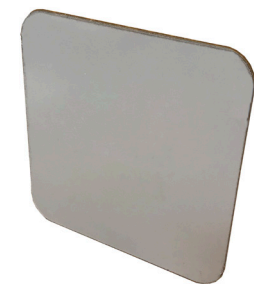
4" x 4" Adhesive