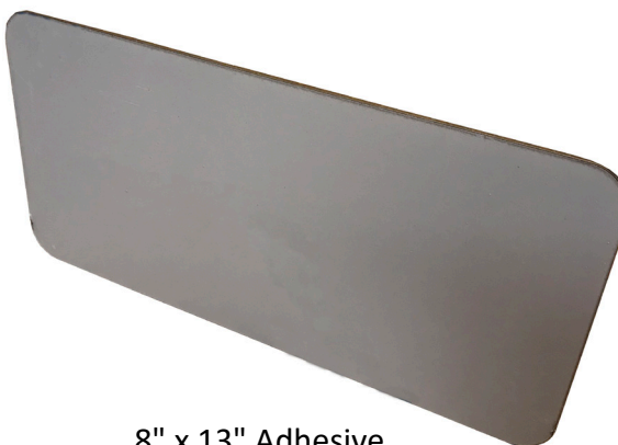
8" x 13" Adhesive