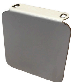
4" x 4" Flange Mount